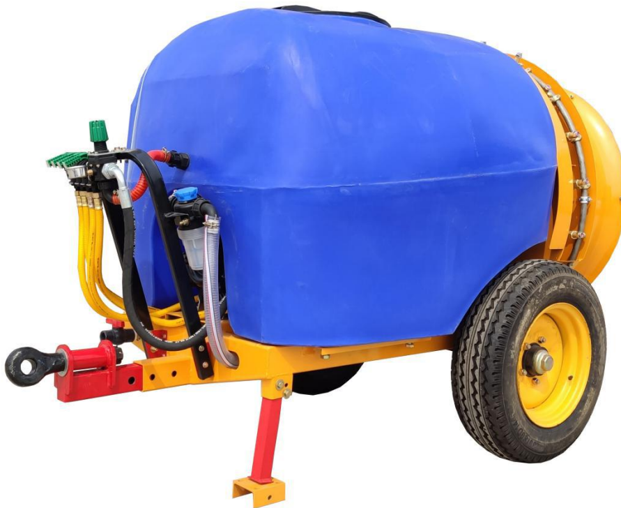
3WFQ-800 whole machine.