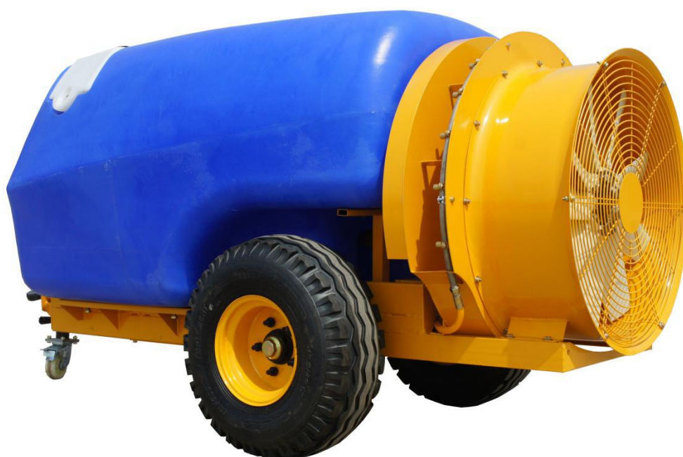
3WFQ-1000 whole machine.