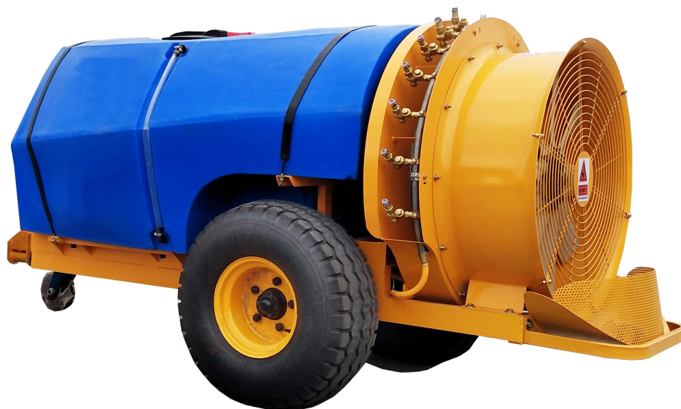
3WFQ-1000 whole machine.